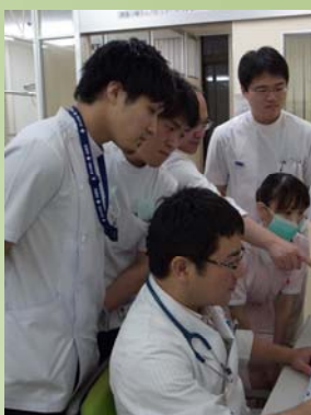
The outpatients of the center of special need dentistry in Okayama University Hospital are increasing every year